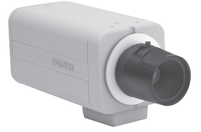
The KTC-105 accepts both C- and CS-mount lenses.

he KTC-105 is an economical, generalpurpose black-and-white security camera that offers 380 lines of resolution and high sensitivity (.01 lux). The KTC-105 accepts both C- and CS-mount lenses. Its selectable backlight compensation prevents important foreground objects from becoming silhouetted against bright backgrounds.